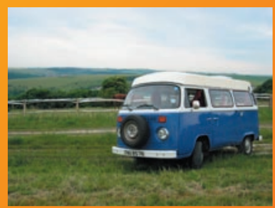
Our home for six months: a 1977 VW camper van

Mounted on the front of our van will be a compact digital camera, which will be constantly recording images of our journey. These images will also be transmitted back to our